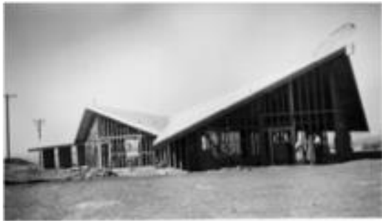
Orange Coast is first built, November 1959