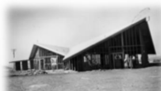
Orange Coast is first built, November 1959