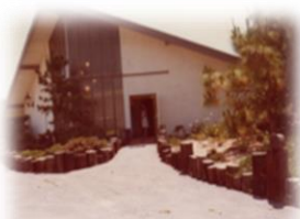
OCUUC in the summer of 1977